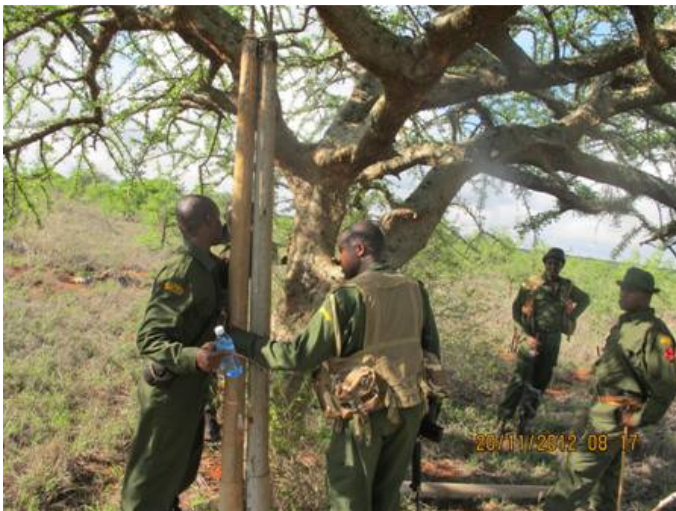
Above: logging near Maktau airstrip