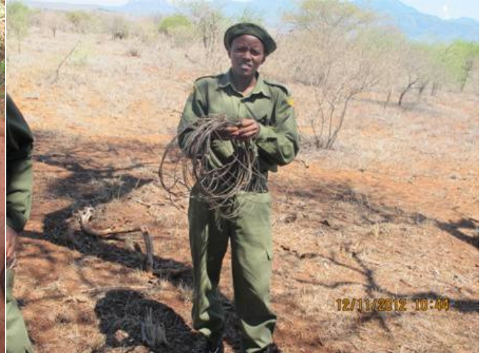
Above: the team removing snares in Taita Hills Sanctuary