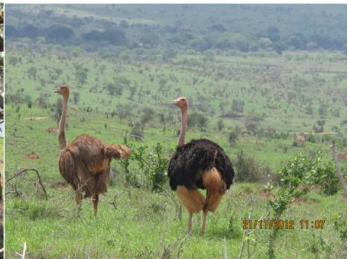
Above: a pair of ostriches seen during patrol