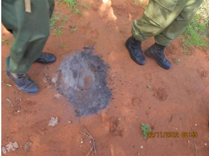
Above: a fresh fire made by a poacher in the Maktau Hills area