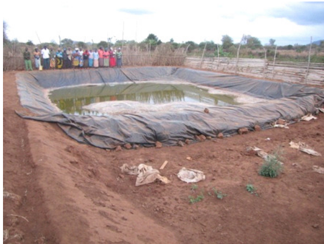
Likoni Self Help Group projects