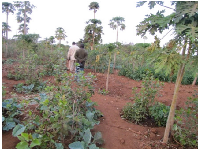
Soto farming project