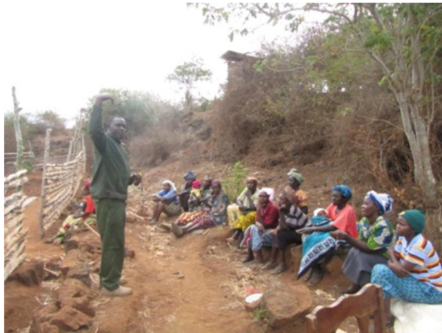
Likoni Self Help Group in Soto Area