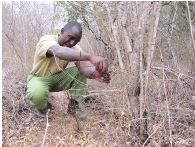
lifting snares at Umani area