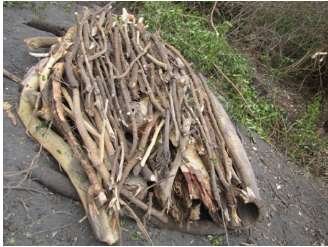
Wood for charcoal kilns