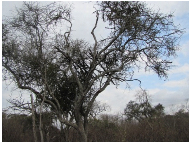
Shooting platforms at Umani