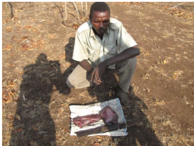
Arrest of Bush meat poacher at Kikunduku area