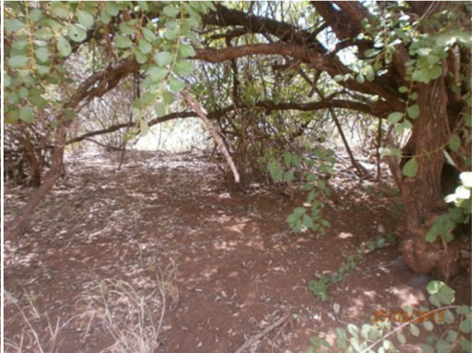
Above: Poachers' hide out from the inside.