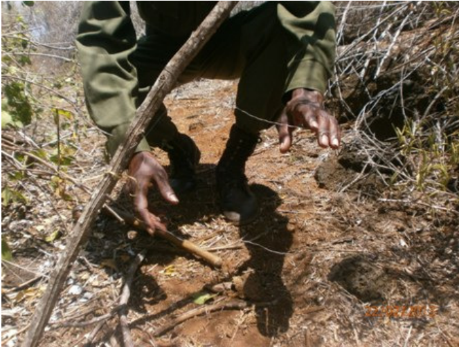
Above: Destroying a snare.