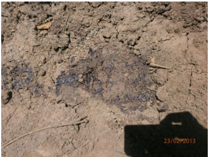
Above: Blood stains.