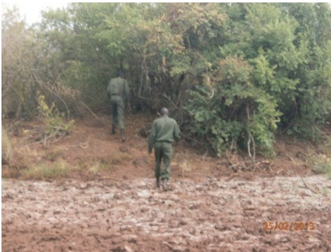
Above: How a poacher's hideout looks like from the outside.