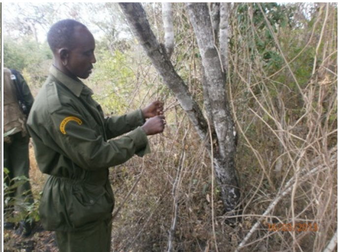
Above: Lifting a snare at Mukuruo