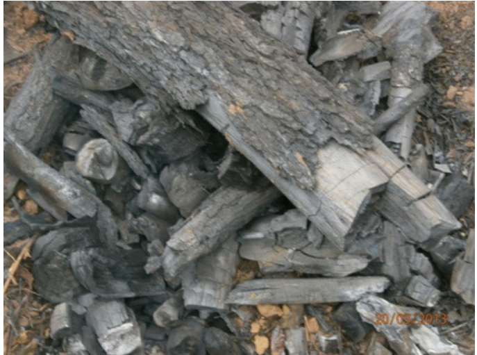
Above: Charcoal burning in Kibwezi area.