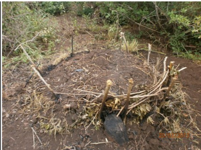
Above: Charcoal burning at Dwa