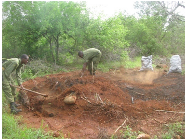
The Team destroy illegal charcoal kilns