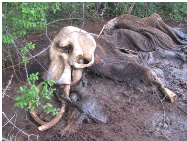
Elephant carcass at gazi area