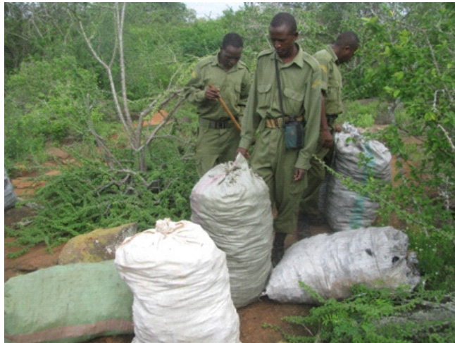
Illegal charcoal bags inside the Park