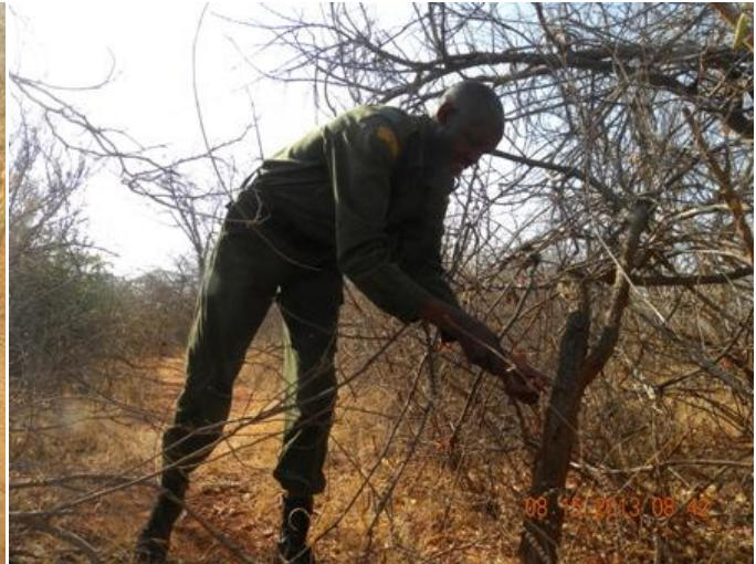
Desnaring at Kanziku area