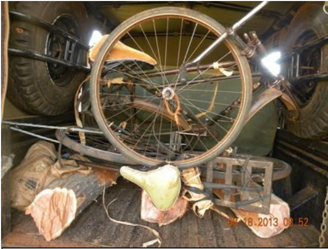
Bicycle and logs recovered from poachers