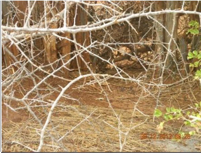
Shooting blind at Leslau area.