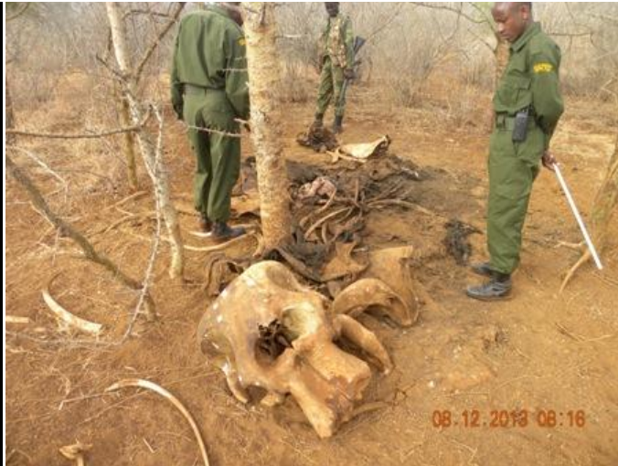
Old elephant carcass found at Leslau dam area.