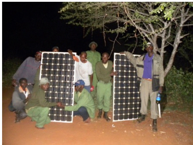
Team recovers stolen Solar Panels