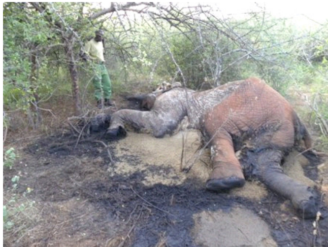
A poached elephant carcass in the Triangle