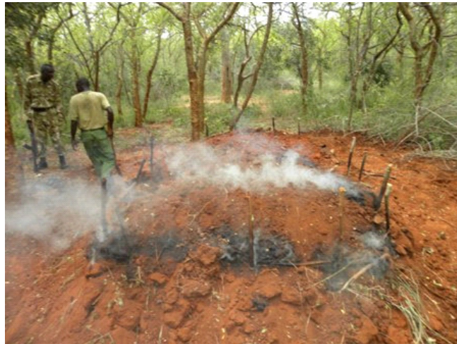
Illegal Charcoal kilns in the Triangle