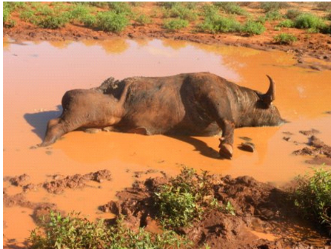
The poached buffalo, killed by an arrow wound