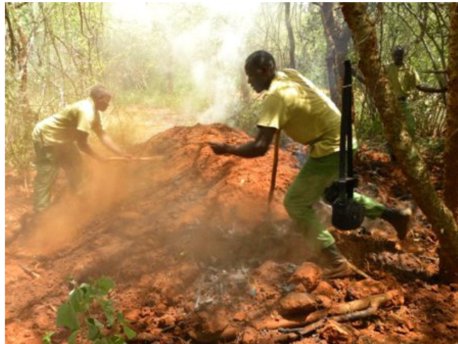
Team destroying the illegal charcoal kilns