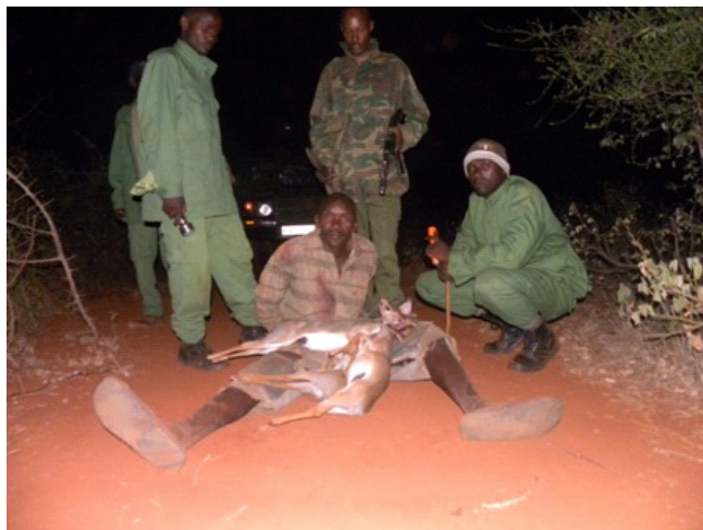
A poacher arrested in possession of Dikdik meat and snares