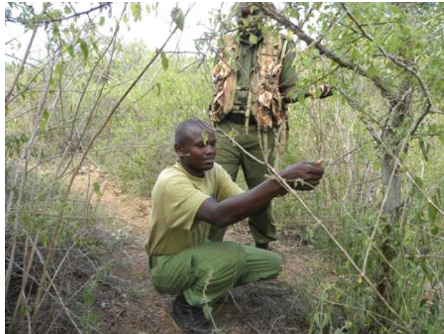
Lifting of snares in the Triangle area