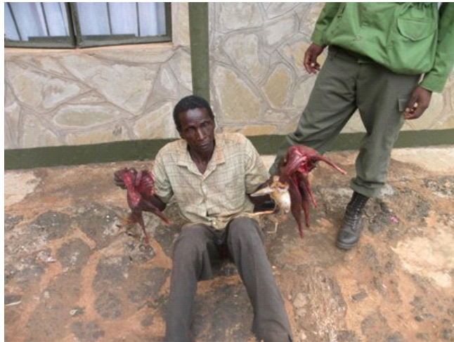
An arrested poacher with bushmeat