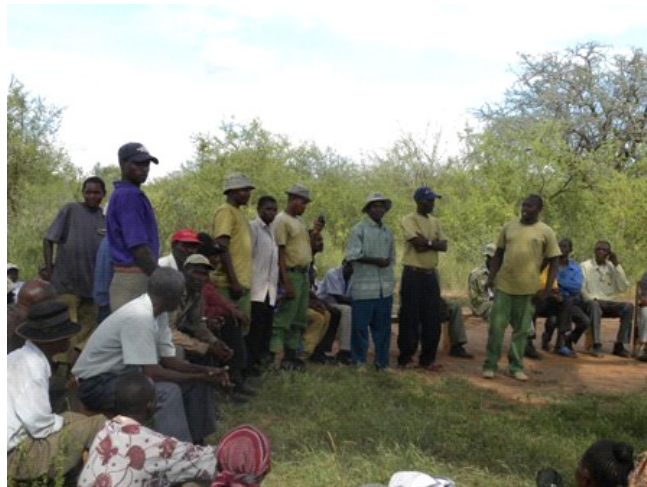
Chief's baraza at Ngiluni