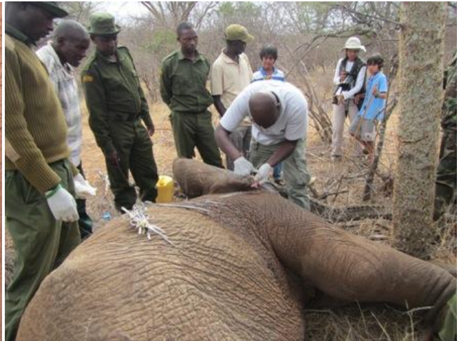
The vet and the team treating a wounded elephant