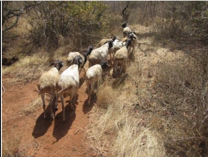
The team driving sheep out of the park.