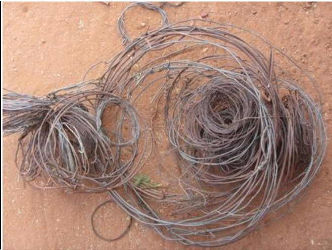
Snares lifted during patrols.