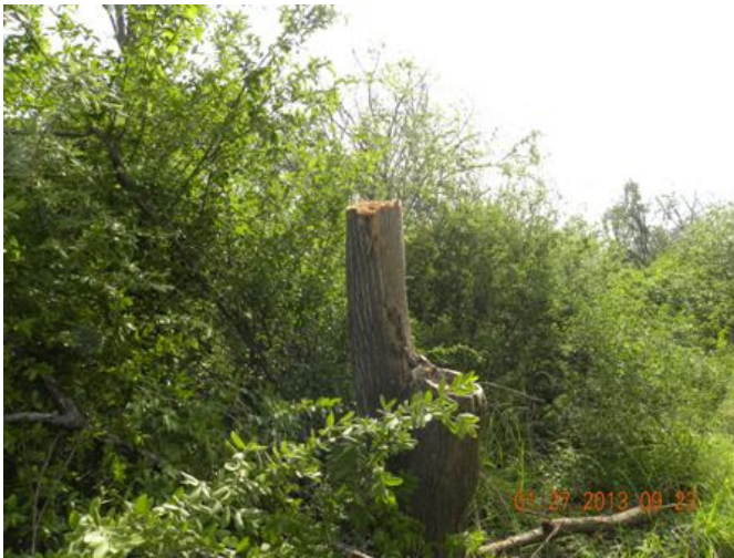
Above: Logging at Mathae