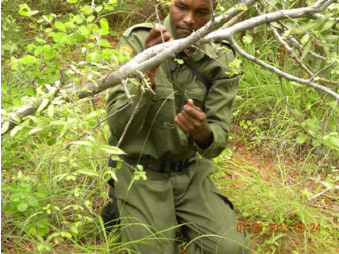
Above: Lifting small snares at Kasala ranch.