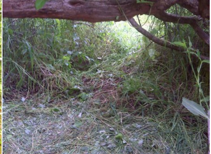
Above: A shooting platform