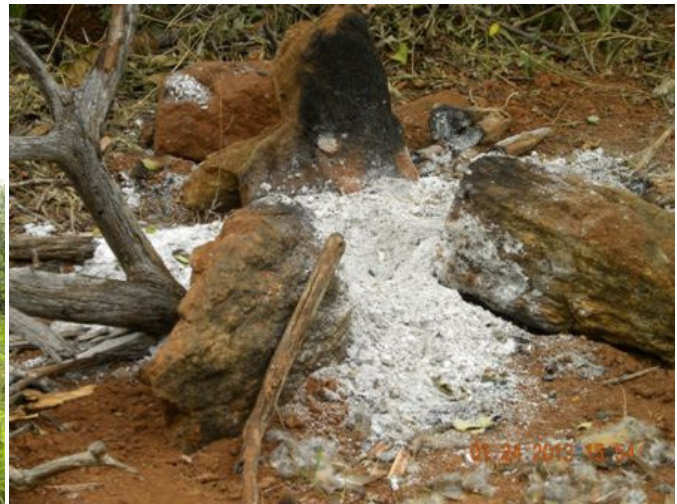
Above: Poacher's hide out at Masobo.