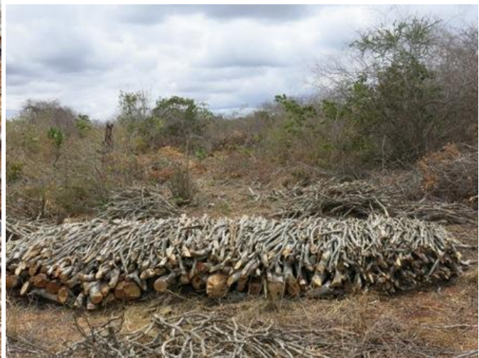
Charcoal kiln at Gazi area.