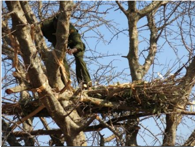
Destroying a shooting platform at Tiva area.