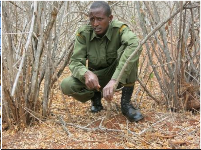
Desnaring at Gazi area.