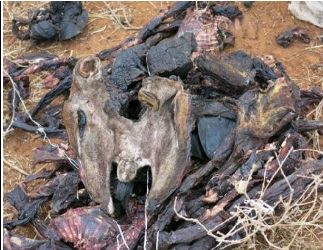
Bush meat recovered from a poacher.