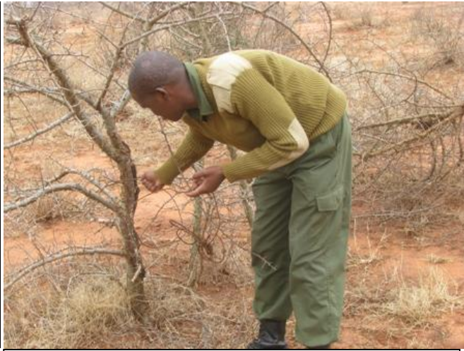
Desnaring at Ziwani area.