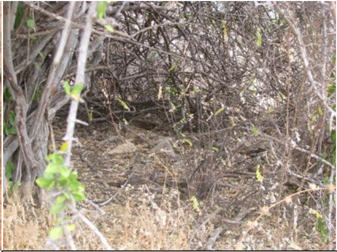
Old poachers' hideout sighted at Kangenchwa