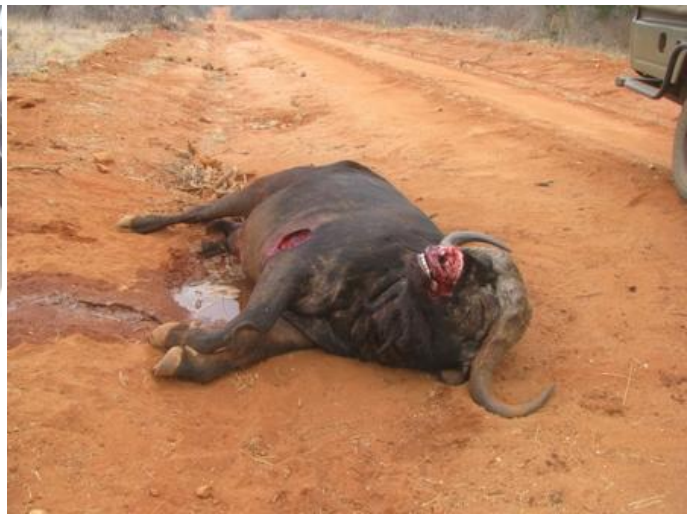
A buffalo carcass near Mzima springs area.