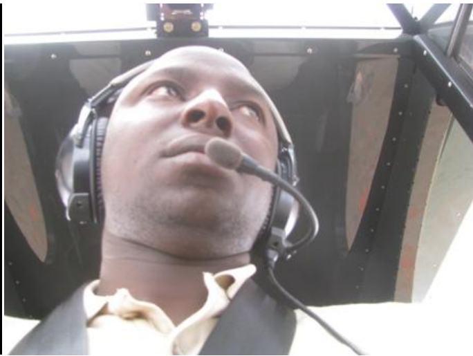
An aerial patrol in Ziwani team's area of operation.